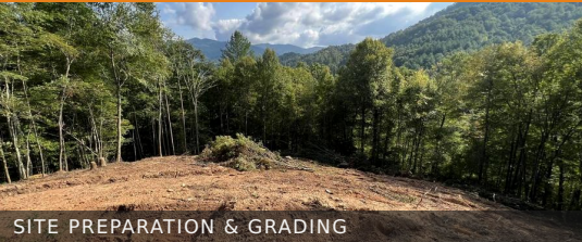
SITE PREPARATION & GRADING

NCDOT PRE-QUALIFIED CONTRACTOR · LICENSED & INSURED · SERVING WESTERN NORTH CAROLINA