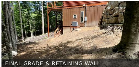
FINAL GRADE & RETAINING WALL