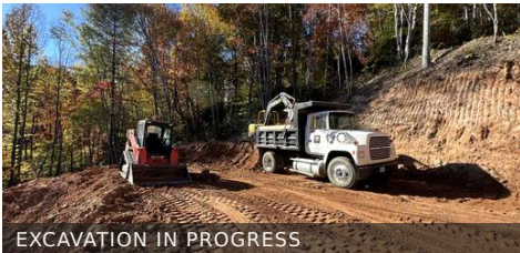
EXCAVATION IN PROGRESS