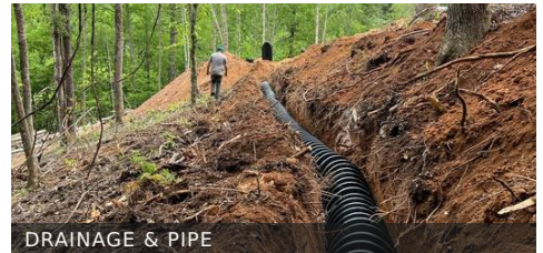
DRAINAGE & PIPE

SAFETY & COMPLIANCE: Erosion and sediment control performed to NCDEQ standards on every site.