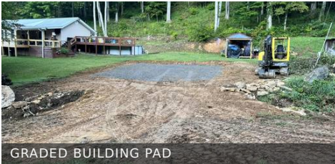
GRADED BUILDING PAD