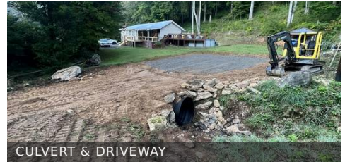
CULVERT & DRIVEWAY